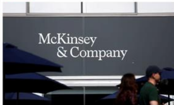
Work on Australian energy and climate policy was outsourced to consultancy firm McKinsey as the government department said it did not have the 'technical capacity'.